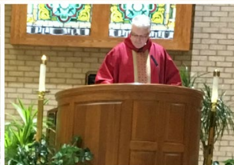
Scenes from Arlington's annual Mass and Dinner held on Friday, September 16 at Saint Bernadette Church in Springfield, VA.