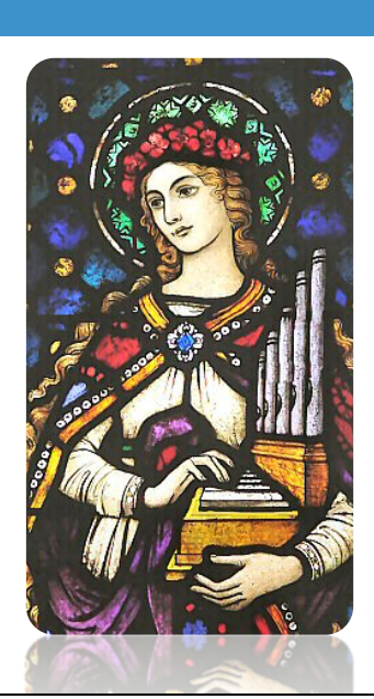
St. Cecilia, pray for us!